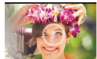
75th Outrigger Hawaii anniversary celebrates the largest collection of resorts and hotels