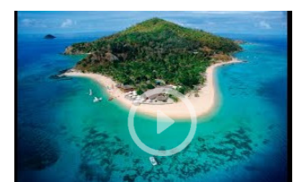
Outrigger Hotels & Resorts celebrate their expanded Asia