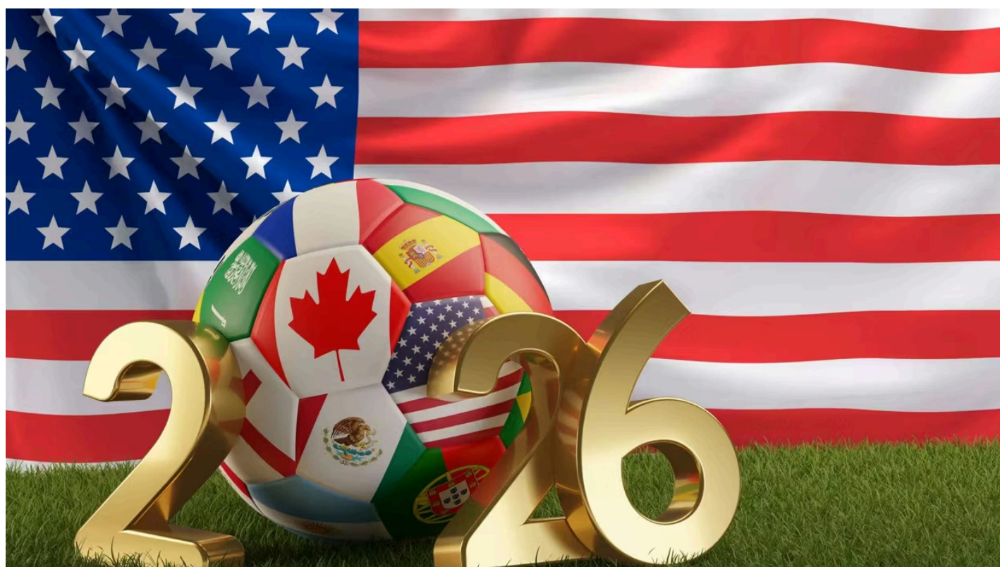
Business travel bookings to U.S. 2026 World Cup host cities rose 46 percent, according to Navan.

Corporate bookings in U.S. host cities up 46 percent